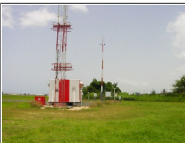
The Automated Airport Weather Station (ASOS) at the Luis Muñoz Marín International Airport in San Juan (looking East).