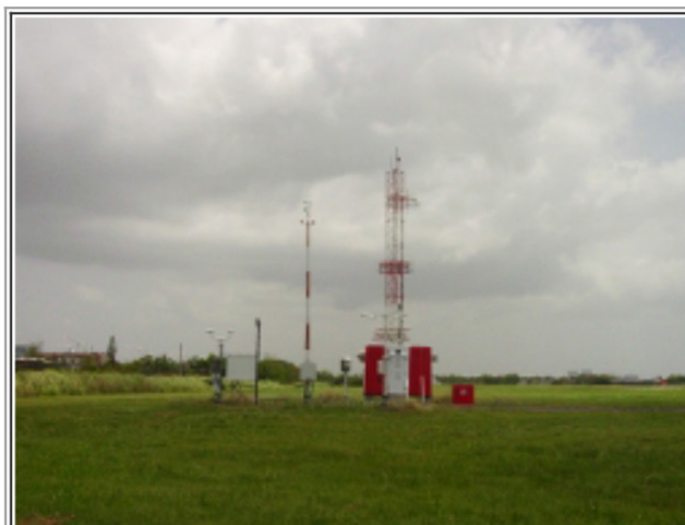
The Automated Airport Weather Station (ASOS) at the Luis Muñoz Marín International Airport in San Juan (looking West).